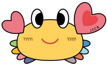
がん研究会有明病院 Cancer Institute Hospital